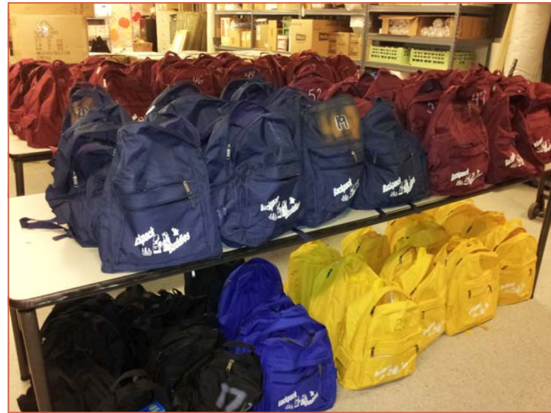
Backpack Buddies backpacks, filled with food and waiting to be delivered to elementary schools