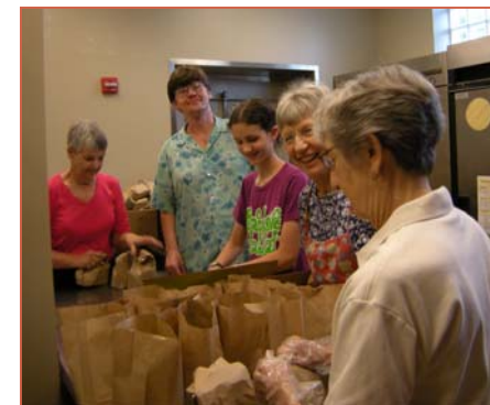
Cheery Summer Breakfast Program volunteers get nutritious sack breakfasts ready to go.