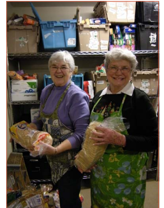
Getting ready to make sandwiches.