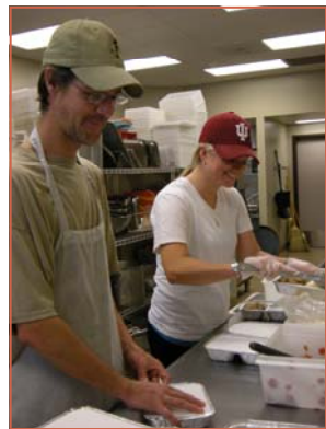
Dishing up carryouts