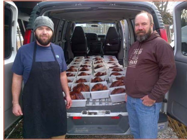
There's nothing like smoked turkey for Thanksgiving!