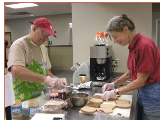
Making sack meals for at-risk children in after-school programs.

Volunteers of all ages help out at Community Kitchen. We rely on over 96 volunteers/wk (120/wk in the summer). The volunteers listed below have contributed the most volunteer hours in 2012: