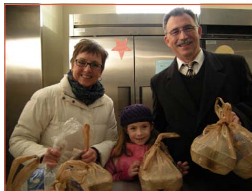
Making delivering Nutrition Links, a family effort.